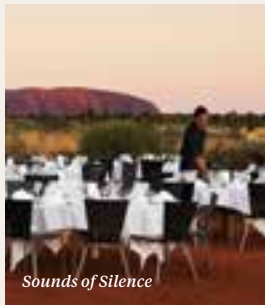
Sounds of Silence

'Tali Wiru', meaning beautiful dune in local Anangu language, encapsulates the magic of fine dining under the Southern Desert sky. This open-air restaurant has magnificent views of Uluru and the distant domes of Kata Tjuta (The Olgas). This unique dining experience caters to no more than 20 guests in one seating. Operates nightly 1 April-15 October.